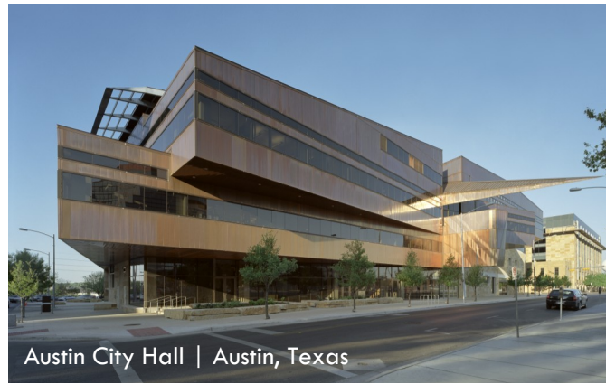
Austin City Hall | Austin, Texas

TxDOT Pre-certified in 3.4.1, 3.5.1, 3.6.1, 5.1.1, 5.2.1, 5.3.1, 5.4.1, 14.3.1