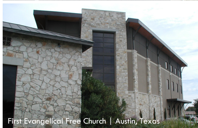
First Evangelical Free Church | Austin, Texas

"We invite you to learn more about P.E. Structural Consultants, Inc. and look forward to helping you solve your next structural engineering challenge."