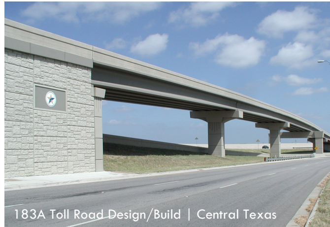
183A Toll Road Design/Build | Central Texas