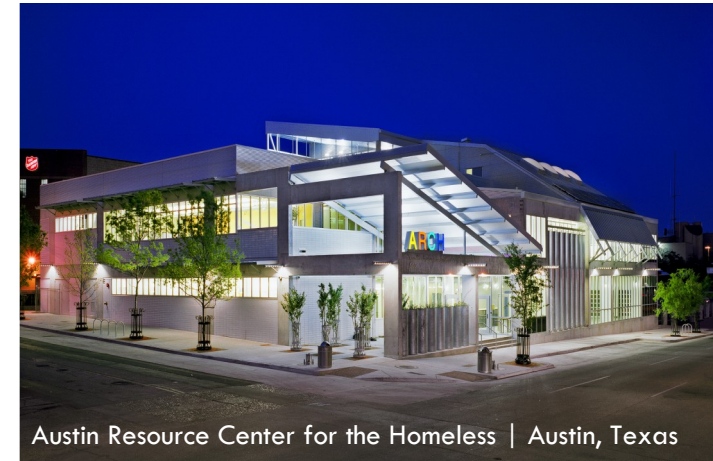
Austin Resource Center for the Homeless | Austin, Texas